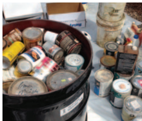
STAINS AND SOLVENTS