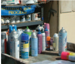
AEROSOLS AND ADHESIVES

These are some of the items accepted at the Community Hazardous Waste Collection Center. See the list inside for Business Disposal Rates.