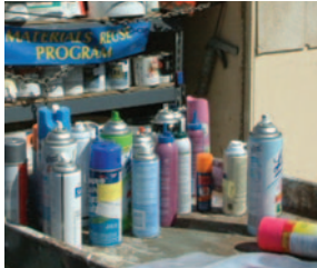
AEROSOLS AND ADHESIVES

These are some of the items accepted at the Community Hazardous Waste Collection Center. See the list inside for Business Disposal Rates.