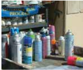
AeROSOLS AND ADHeSives

These are some of the items accepted at the Community Hazardous Waste Collection Center. See the list inside for Business Disposal Rates.