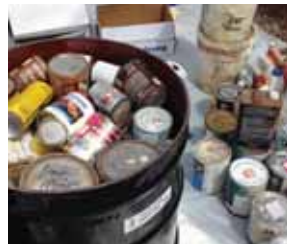
STAINS AND SOLVeNTS