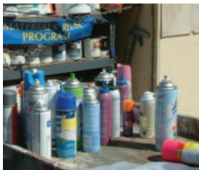
AEROSOLS AND ADHESIVES

These are some of the items accepted at the Community Hazardous Waste Collection Center. See the list inside for Business Disposal Rates.