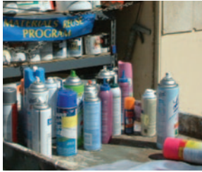
AEROSOLS AND ADHESIVES

These are some of the items accepted at the Community Hazardous Waste Collection Center. See the list inside for Business Disposal Rates.