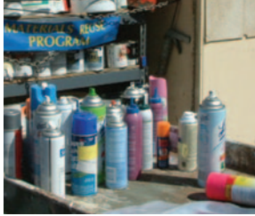
AEROSOLS AND ADHESIVES

These are some of the items accepted at the Community Hazardous Waste Collection Center. See the list inside for Business Disposal Rates.