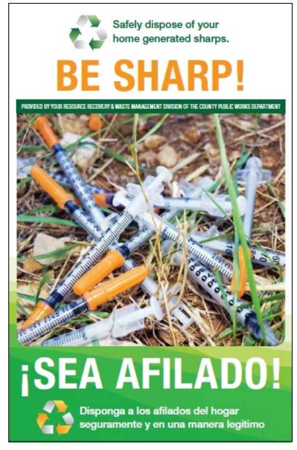
Cover of the County's Home-Generated Sharps Disposal Brochure